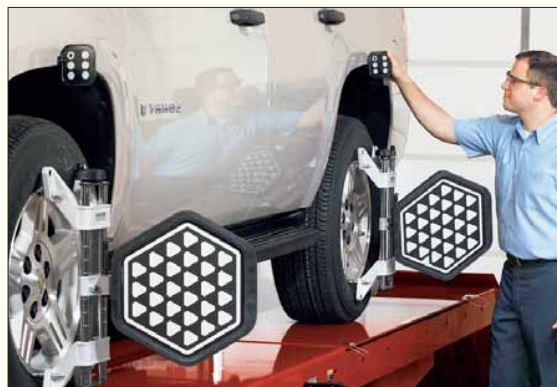
The Live Ride Height Measurement Kit option includes four body-mounted targets. When installed, the measurements are instantly displayed on the aligner screen in a dynamic 3-D model.

The newly released version 9.0 of Hunter's award-winning WinAlign® alignment software supports new features and capabilities that can increase profitability by speeding alignment service and addressing new OEM service requirements.