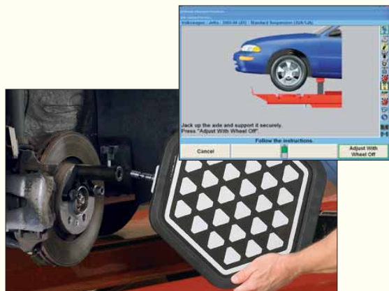
When the vehicle is raised for Wheel-Off Adjustment, the JackDetect™ feature automatically switches to "jack up" adjustment mode. Wheel-Off Adjustment Adaptor Kit options allow sensors or DSP600 targets to be mounted directly to the hub.

New software screens provide additional orientation and instant access to bar graphs in the Virtual View display mode.