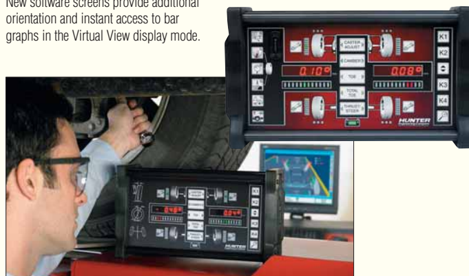
The Cordless Icon Remote Indicator, at bottom, and the Cordless "Plus" Remote Indicator function as a remote control from anywhere underneath or around the vehicle.