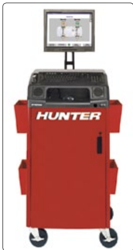
S811-17-SS console with 17" color monitor

SS100 screens are easily printed for service records or to help explain needed service to customers.