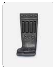
Insert Ready Tool Head (RP6-G1000A89)