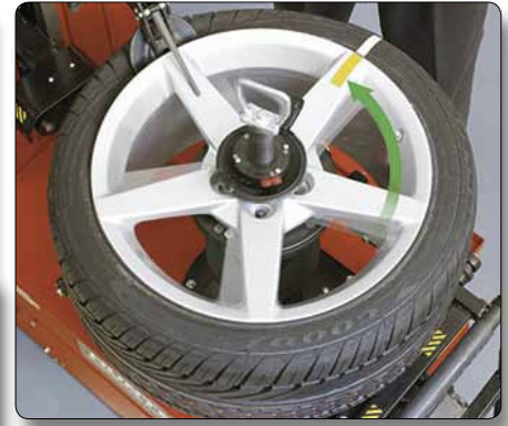
Match-mounting the stiffest point on a tire to the low spot on a rim makes the assembly roll as round as possible.