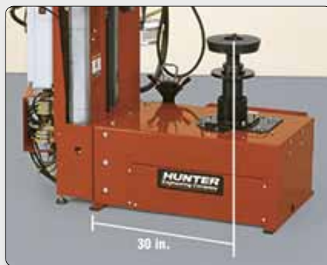
Standard position, handles 10- to 30-in. wheels.

Three-position expandable base adds versatility. Start with standard 30-in. configuration. When you service larger wheels, simply loosen 9 bolts to slide base out for 32-in. or 34-in. capability. No expensive kits or modifications necessary.