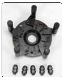
Flange Plate Kit (RP6-G1000A87)