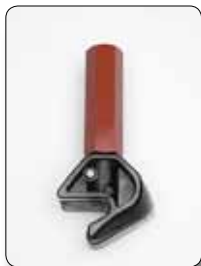
Contoured Press Head (RP6-G1000A94)