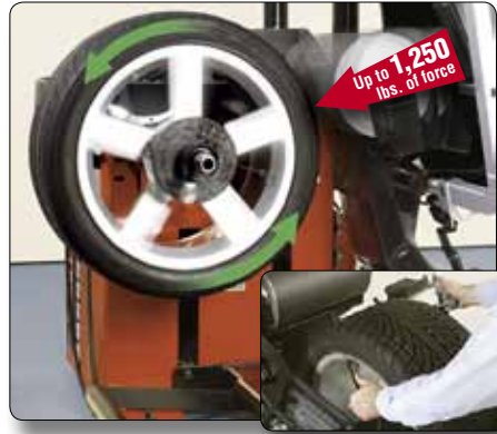
The Road Force balancer identifies tire and rim contributions to radial vibration problems.

The Auto34 makes match-mounting easy with bead rollers that allow the operator to spin the tire on the wheel regardless of aspect ratio or tire stiffness.