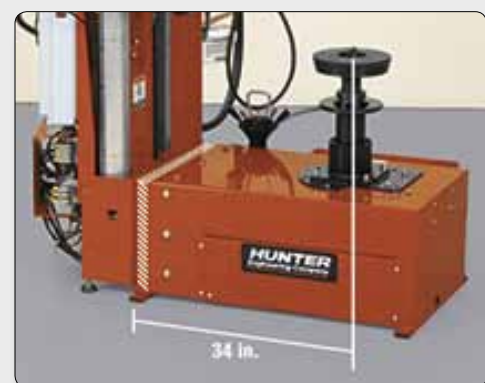
Extended position, handles 14- to 34-in. wheels.

Because of continuing technological advancements, specifications, models and options are subject to change without notice.