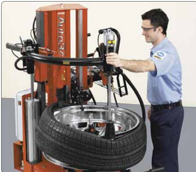
Bead press arm pushes tire in drop-center for easier mounting.

The bead press arm is secured to the tool head controls and is cleared out of the way automatically as the tool head is raised.