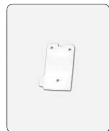
Inserts for Tool Head above 50 pcs. (RP6-G1000A90K)