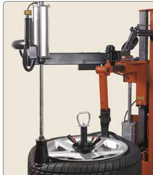
Bead press arm eases de-mounting of a standard tire. Used to press opposite side of tire into drop-center.