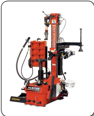
Shown with optional wheel lift.