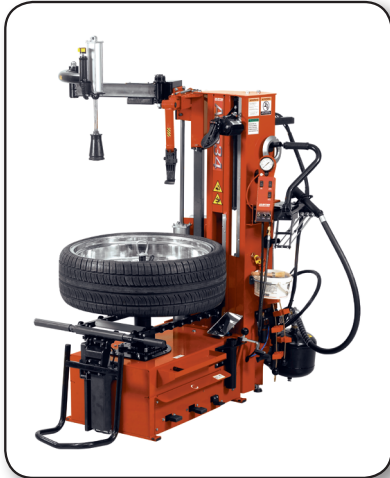
Shown with optional wheel lift.