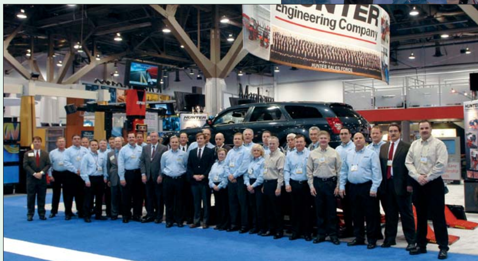
Hunter staffs its NADA exhibit with sales, service, engineering and customer service experts to ensure that dealership owners and representatives quickly receive the information they need.