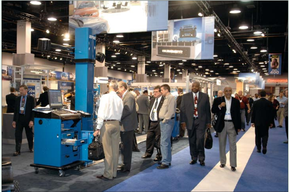
Hunter was also invited to display equipment in many of the OE equipment program exhibits including GM Dealer Equipment, shown above.