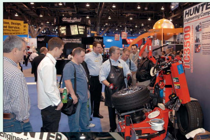
Exhibition staff demonstrate the productivity and profitability features of Hunter equipment.