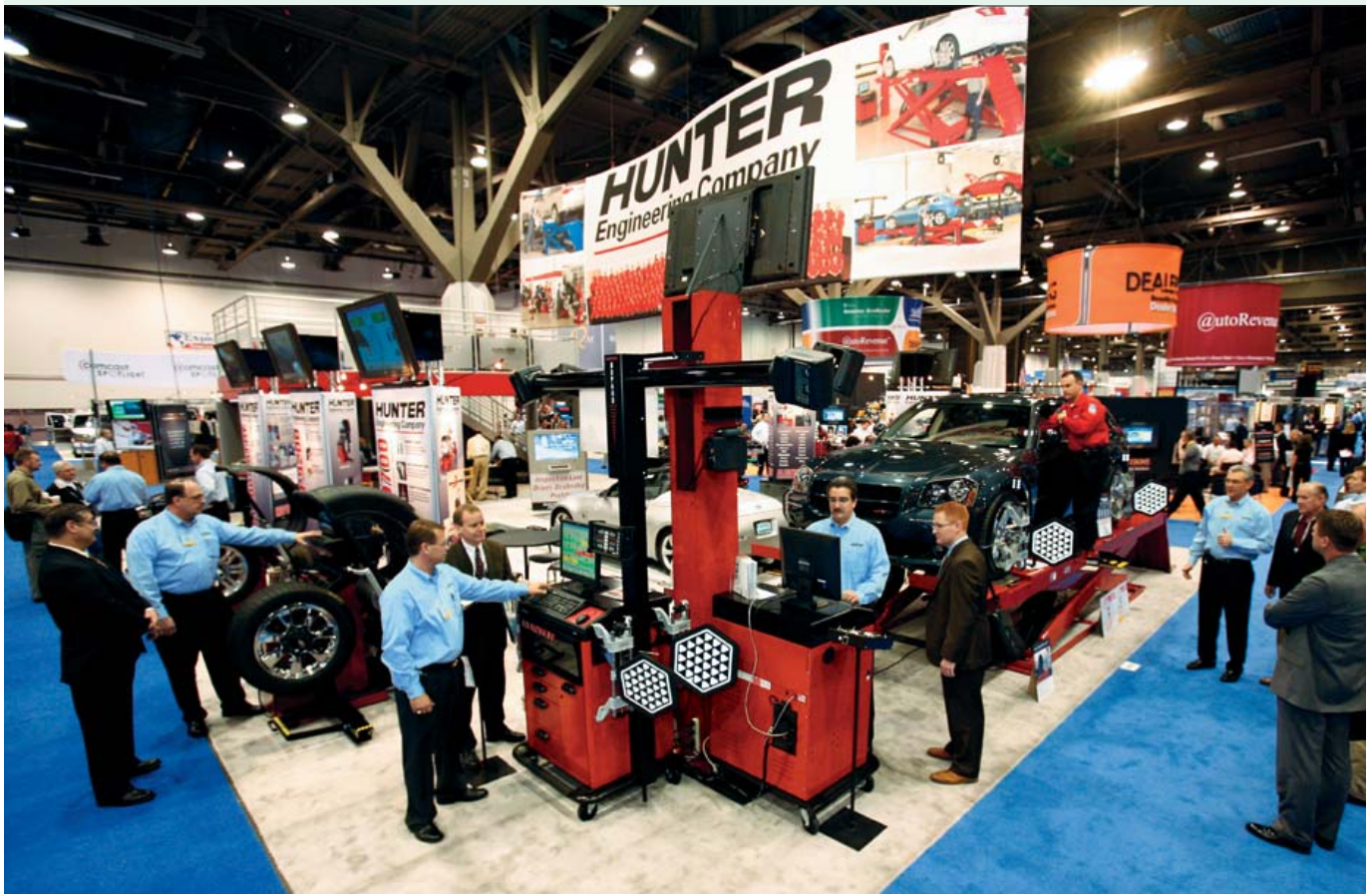
Hunter's main exhibit at the 2007 NADA event included a complete line of OE-approved undercar service products.