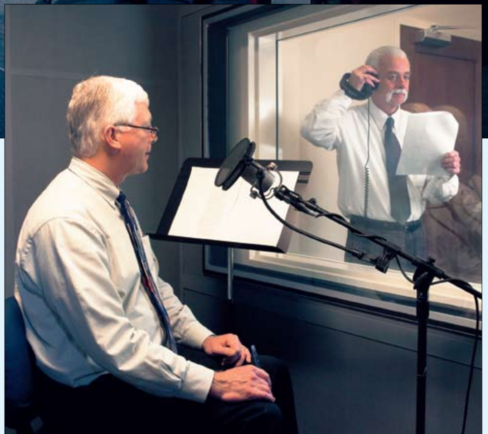
Audio production is completed in the studio's sound booth. Voice-over translations are often produced in multiple languages for media content with worldwide distribution.