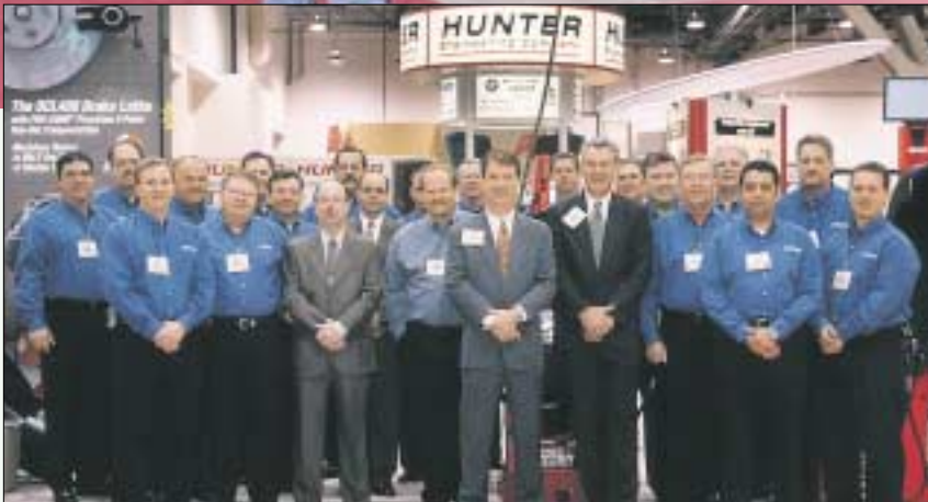
The NADA exhibition lets Hunter staff members meet face to face with automobile dealers and match their service bay needs with the newest undercar service technology.