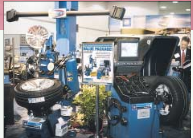
OE-specific Hunter equipment was on display in GM and other manufacturer exhibits.