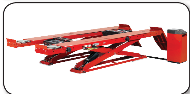
RX72-IS Shown (jacks optional)