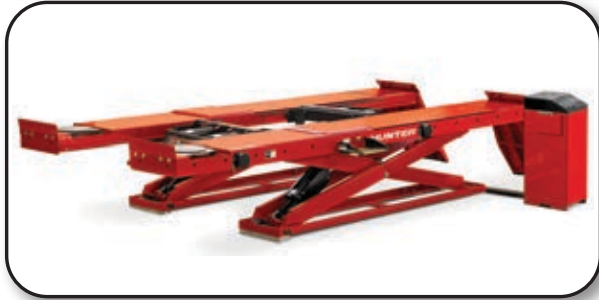
RX45KIS-215E Shown (jacks optional)