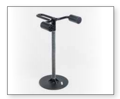
Steering Wheel Holder 28-75-1