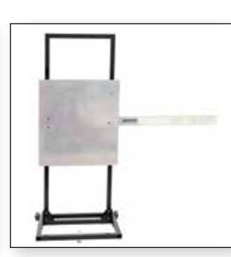
191-37-1 Reflective fixture