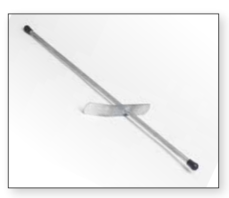
Brake Pedal Depressor WA15-S