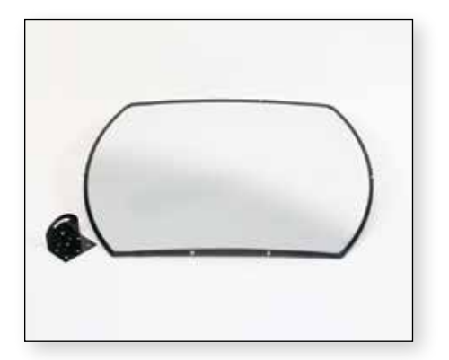
Convex Mirror 213-47-2