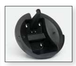
Includes four brackets. Targets sold separately.