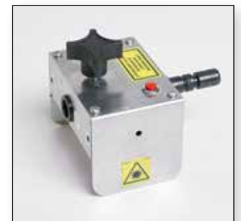
15-60-1 Double-ended laser aiming tool