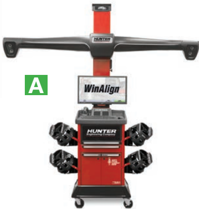
Aligner with WinAlign 16.1 or newer*

* For compatibility with aftermarket kit shown.