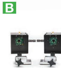
Hunter Camera Kit and Adaptors (20-3683-1) for use with non-Hunter ADAS Kit ( [C] )

* For compatibility with aftermarket kit shown.