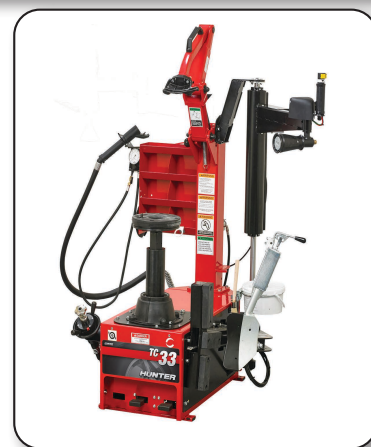
TC 33PL Shown

For general inquiries visit: www.hunter.com or call 800-448-6848