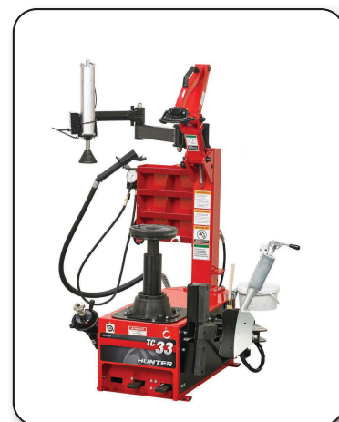
TC 33BP Shown