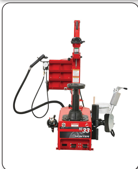
TC 33 Shown