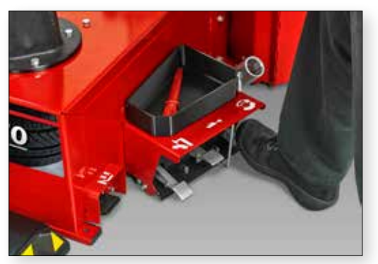
Inflation, rotation and column swing operations are controlled by foot pedals.