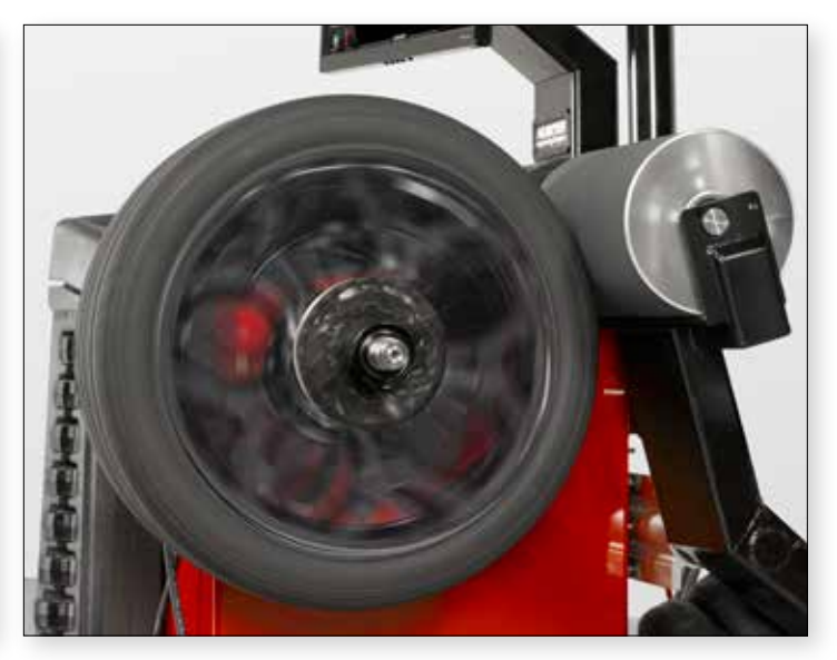
When used with Hunter's Road Force<sup>®</sup> Elite GSP9700, the TCX70 quickly and easily helps eliminate vibration problems balancers alone can't fix.