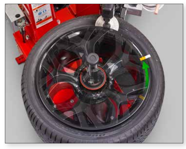
The TCX70's bead rollers allow spinning of tire on rim, helping match-mount stiffest point on tire to low spot on rim.