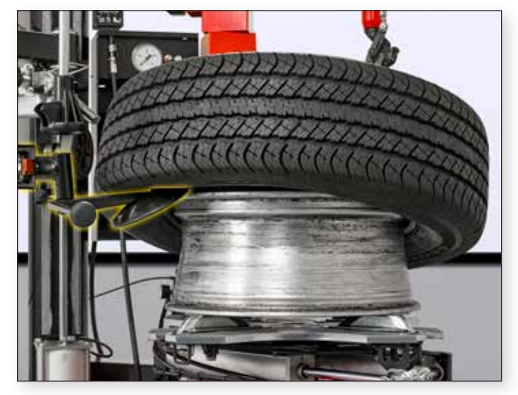
Demounting with locking arm

Demount heavy, stiff or wide tyres easily with roller disc.