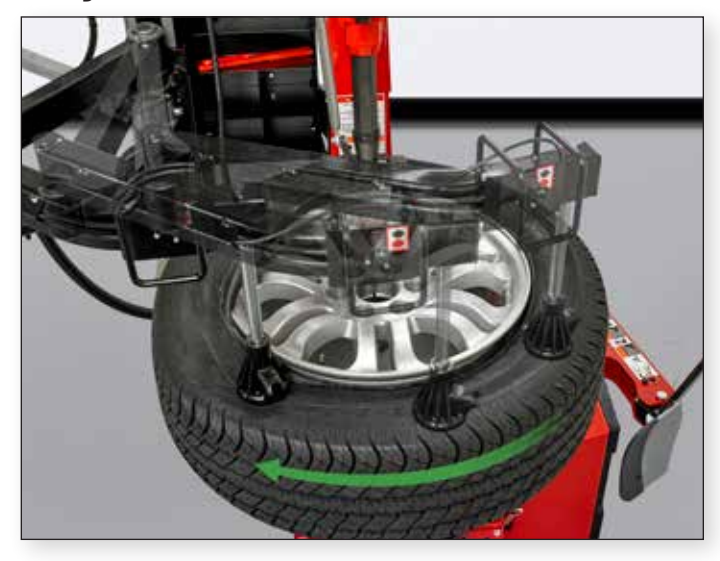
Keeps tough tyres in the drop center

Fast, intuitive operation with best-in-class power.