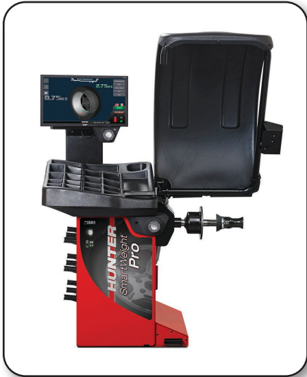
SWP90 with Hood and Outer Laser option