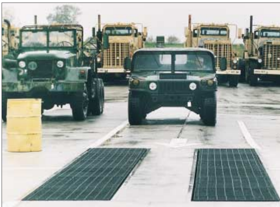
Military vehicles tested at Fort Hood include the Humvee, an Army tractor and 911 Tank Transporters.

H unter's B400T Computerized Brake Tester and SS100T Computerized Sideslip Tester keep the U.S. Army Logistics Maintenance Division and Third Mobile Armored Corps, rolling safely at Fort Hood, Texas. The Division is responsible for vehicle repair at Fort Hood and the evaluation of vehicle maintenance equipment and procedures for Army operations. The B400T also helped Fort Hood earn the prestigious Vice President of the United States' "Hammer Award" for saving taxpayers millions of dollars while upgrading military readiness. Other U.S. armed forces facilities using the B400T include: Fort Lewis, Washington; Camp Pendleton, California; Fort Benning, Georgia; Fort Carson, Colorado; Fort Leonard Wood, Missouri; and bases overseas.