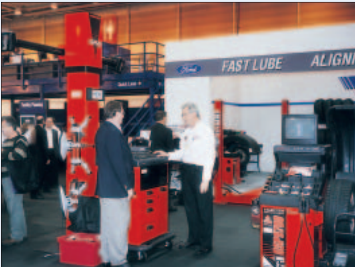
Ford Motor Company and General Motors were among the automobile manufacturers to invite Hunter to exhibit dealership service equipment in their booths. The Series 811P-Plus Aligner (shown at right) with DSP600 Sensors and RX Scissor Lift displays the GM Dealer Equipment color specification. Hunter supports Ford's Quick Lane service concept (shown above) with equipment designed to make undercar service faster and more efficient.