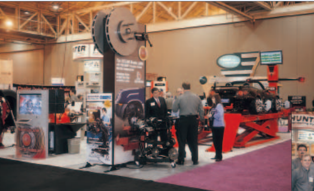
Hunter staff members recently traveled to New Orleans to help introduce the company's newest undercar service equipment to the thousands of National Automobile Dealers Association Convention and Exposition attendees.